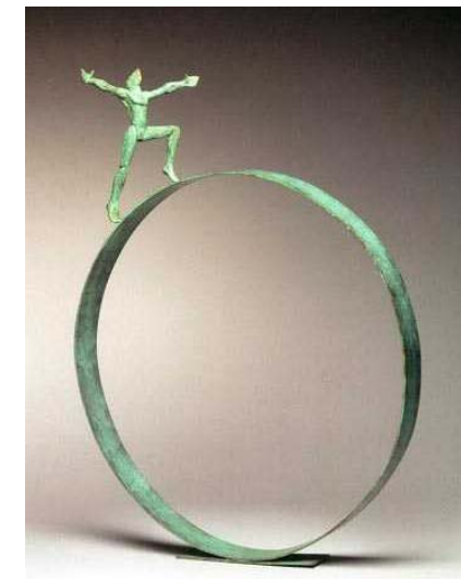
Sculpture courtesy of Igor Ustinov

Lower Ground Floor: Crans Montana and Zermatt